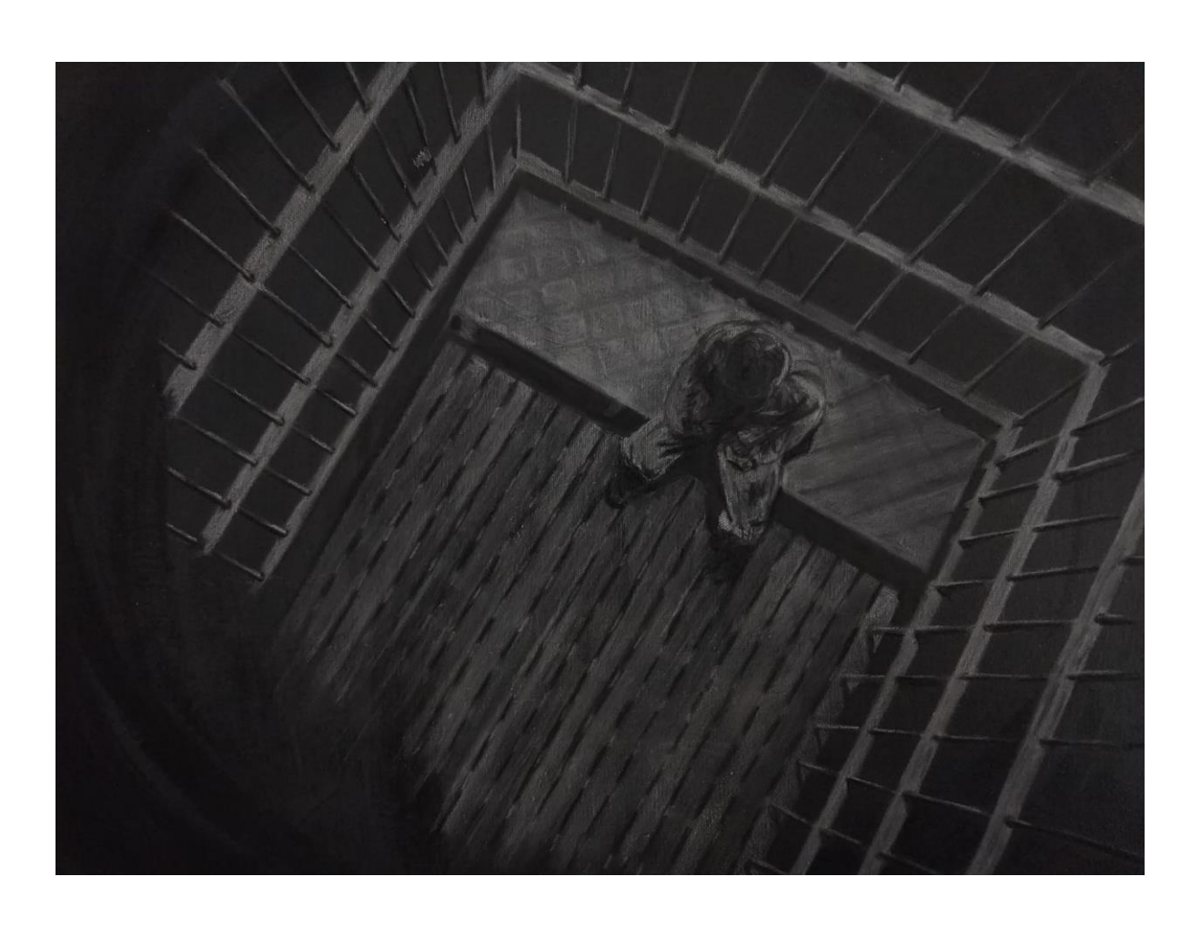
"Home or Prison"

White charcoal and acrylic on canvas 40cm x 150cm