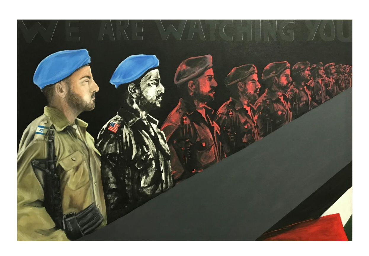
"We are Watching you"

Acrylic and oil pastels on canvas 90cm x 120cm