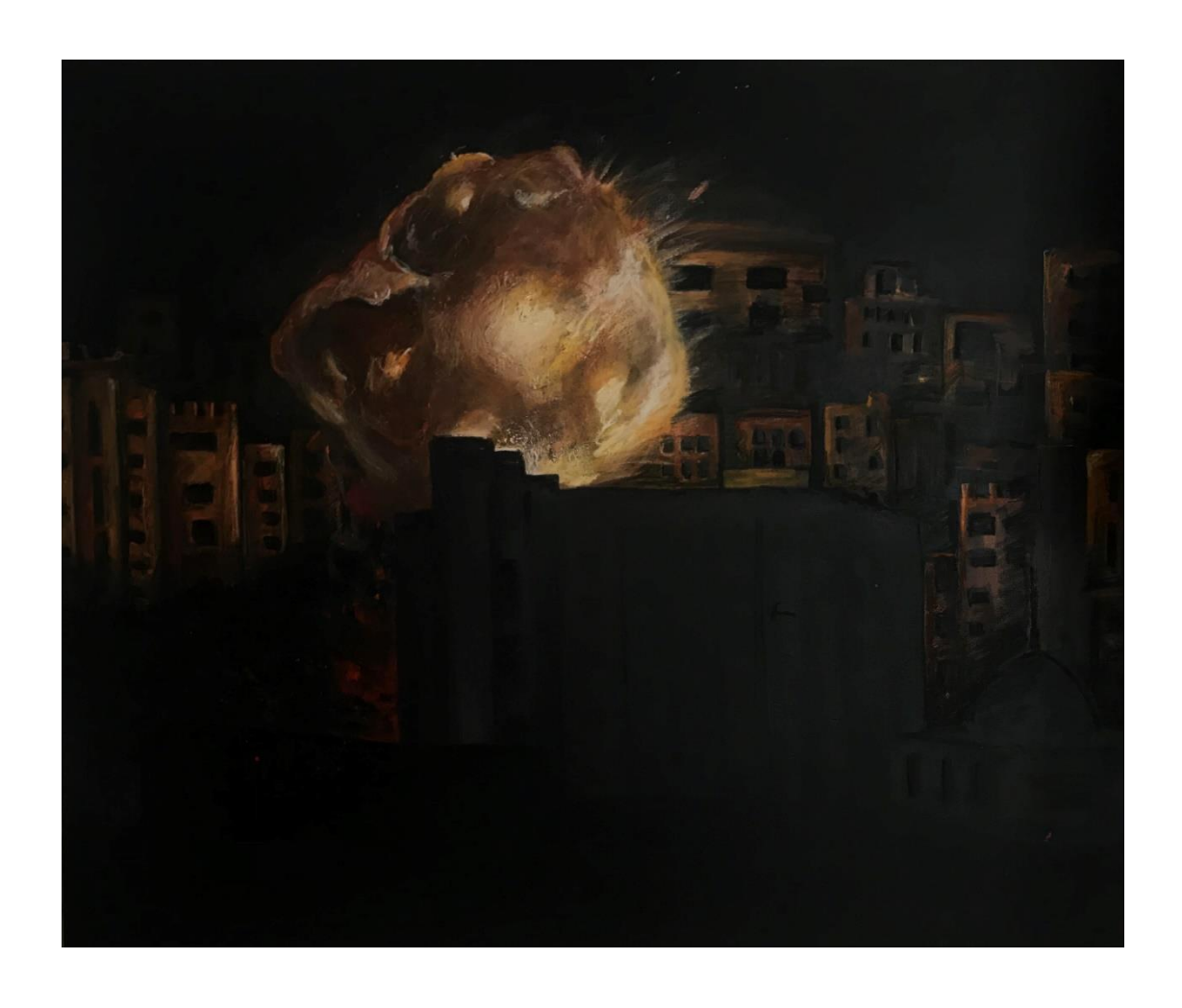
"Nightfall in Gaza"

Acrylic and oil pastels on canvas 100cm x 120cm