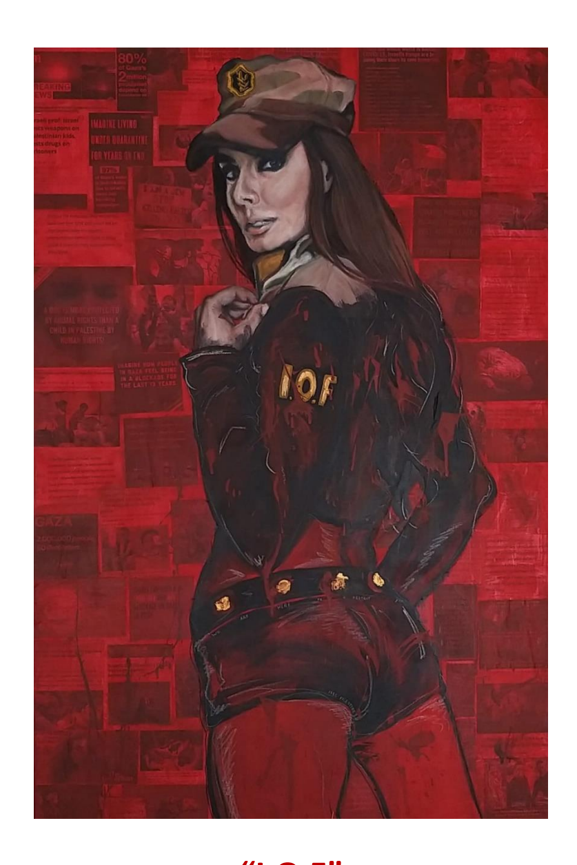
"I.O.F" Acrylic, collages, and oil pastels on canvas 120cm x 80cm

In the background of this painting, you find dozens of collages of the current news in Palestine. A violent red layer of paint covers them, making it harder to read. Who made that layer was Israel and their military, the so called "Israel Defence Forces". As a criticism to the military name, the artists hanged if for "I.O.F.", meaning "Israel OFENCE Forces".